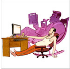
Putting Your Best Cyberface Forward