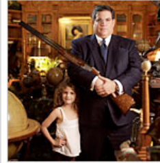
The Office, Housebroken