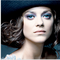
French Kiss: The Actress Marion Cotillard

Timothy Egan probes what some Republicans would rather not acknowledge about the Mike Huckabee candidacy.